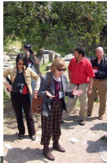
A confused tour guide with bemused NAI members.