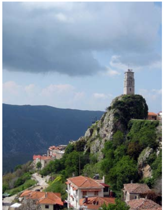
Spectacular village locations.