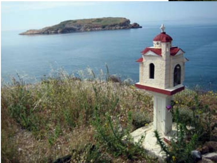
Roadside memorials to crash victims abound.