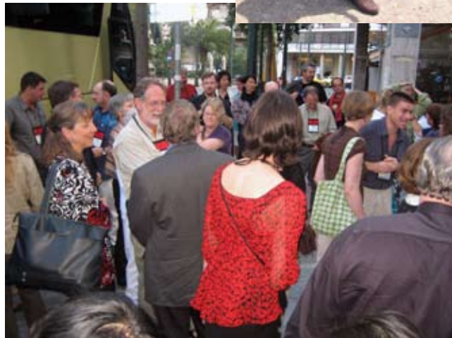
Group explorations of antiquities and night life were well attended.