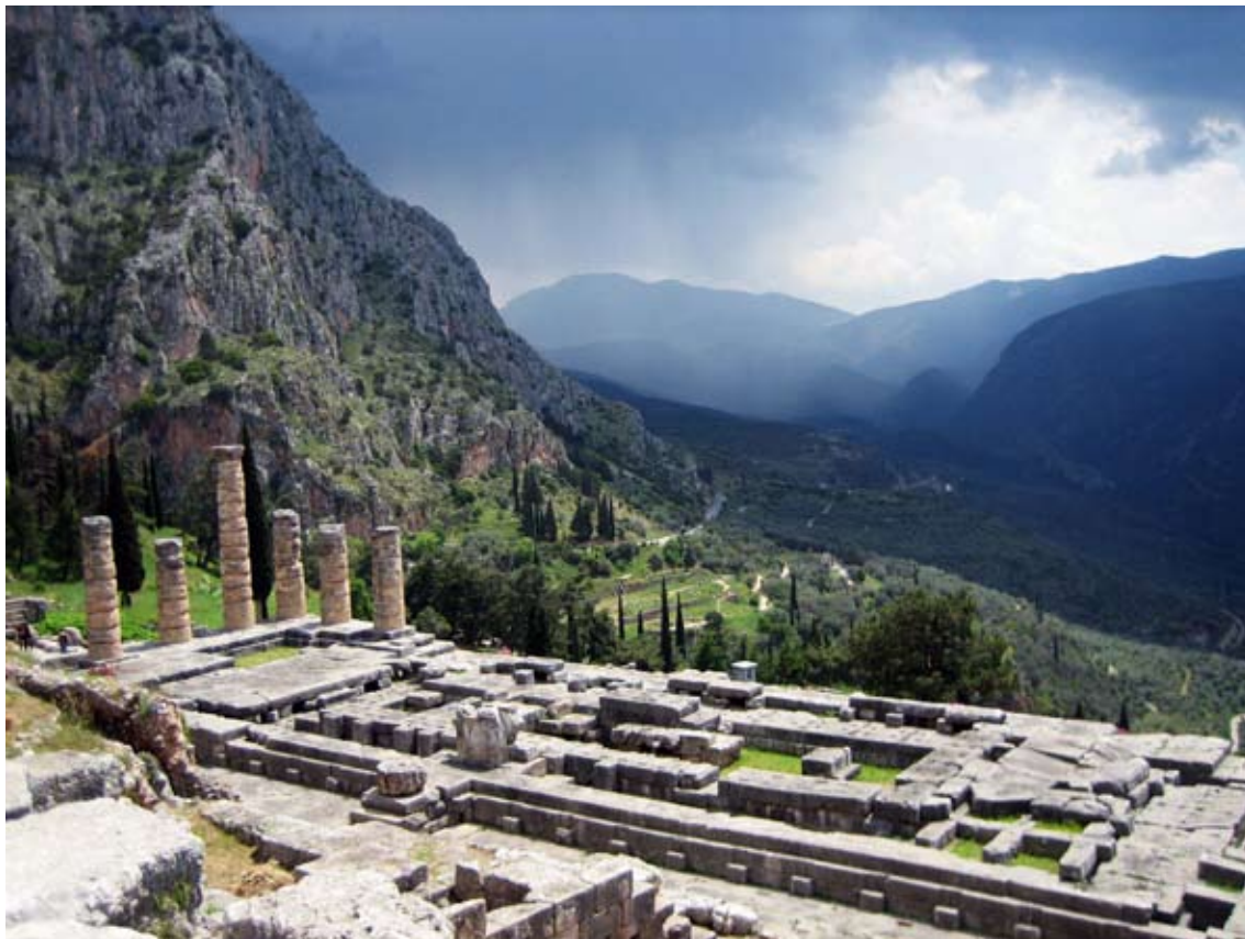
Temple of Apollo at Delphi was visited by NAI International Conference attendees in Greece.

And also, the results of the first election for the board of directors. Thanks to all of you who voted. Member support is vital to a healthy group, and our section appears to be in excellent condition.