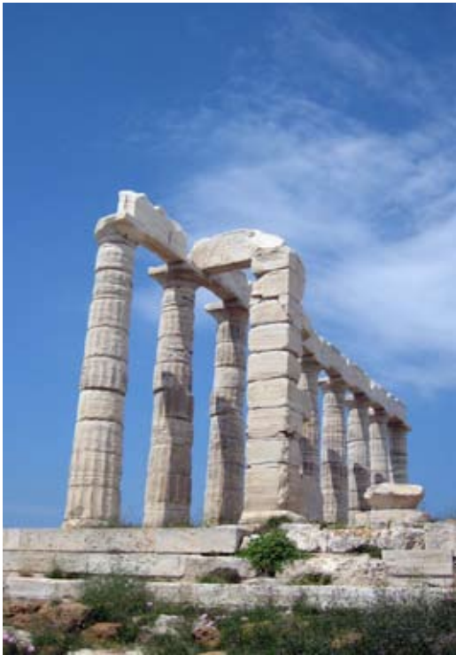
Temple of Poseidon